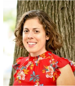
Erica Curcio Goddard House